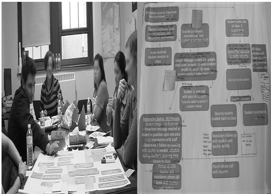
Fig. 3 Modeling and examining actions and a mediating artifact for designing the culturally responsive discipline system at Ponderosa High School

Moreover, there was a no “reverse button” in the system. Once the ODR was initiated, the only possible product of the school discipline machinery would be the student with problem behaviors (the object of the school discipline) with a possibility of a student with special education placement for emotional disturbance. The system was incapable of creating contextually situated object such as a student in a dysfunctional classroom context, a student in conflict with a teacher, a student who did not received high quality academic instruction in class, teachers without adequate time, support, and professional learning opportunities whose only tool was ODR to manage classroom, or a school with a culture of referral or an unsafe,